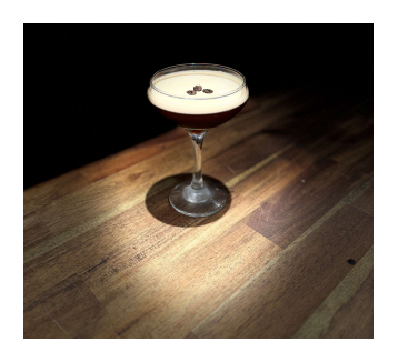
ESPRESSO MARTINI $20 Gin shaken with Coffee Liqueur, an espresso shot and a hint of sweetness. Garnished with fresh beans