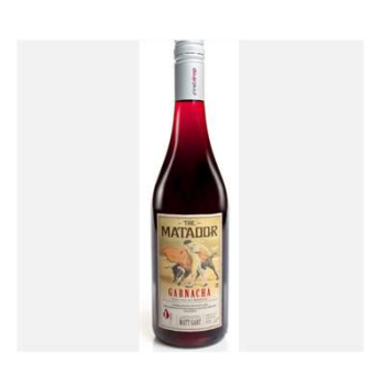
GLASS $12 BOTTLE $56 First Drop The Matador Garnacha