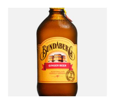
BOTTLE Bundaberg Ginger Beer