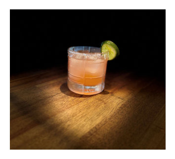
VODKARITA $18 Vodka, Blood Orange Liqueur, fresh squeezed lime juice and a hint of agave. Garnished with a salted rim and lime wheel