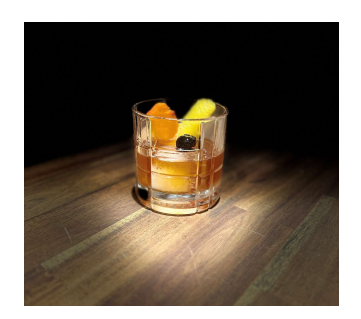
OLD FASHIONED $20 Single Malt Whiskey with a hint of sweetness. Garnished with Lemon, Orange and a Maraschino Cherry.