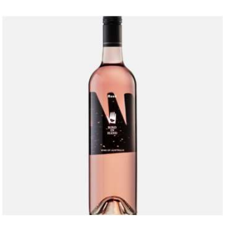
BOTTLE Bird in Hand Rose Adelaide Hills