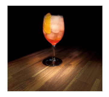
BLOOD ORANGE SPRITZ $16 Blood Orange Aperitif with soda water and Prosecco. Garnished with a fresh orange slice.