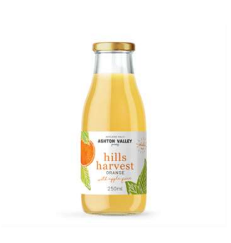
BOTTLE Ashton Valley cloudy apple and Orange