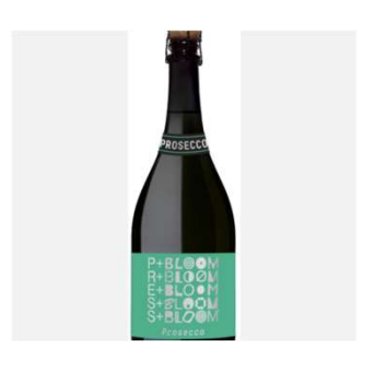
GLASS $11 BOTTLE $50 Press and Bloom Prosecco