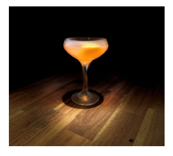
COSPARKOLITAN $18 Vodka and Blood Orange Liqueur shaken with fruit juice and freshly squeezed lime juice. Garnished with an orange coin.