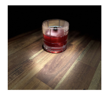
GRANDHATTAN $22 Single Malt Whiskey stirred with Sweet Vermouth. Garnished with a Maraschino Cherry.