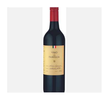
BOTTLE $60 Amadio Vino Di Famiglia Sangiovese