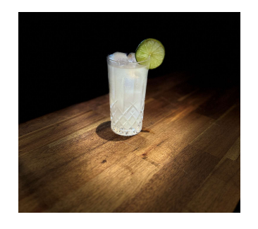
VIC PARK MULE $18 Vodka mixed with freshly squeezed lime juice. Topped up with ginger beer and garnished with a lime wheel.