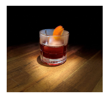
NEGRONI $18 Even measures Gin , Campari and Sweet Vermouth . Garnished with an orange twist.