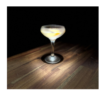
DRY MARTINI $20 Gin and Dry Vermouth stirred together with a hint of orange bitters. Garnished with an orange