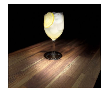
LIMONCELLO $16 Limoncello with tonic water and Prosecco. Garnished with Fresh lemon slice