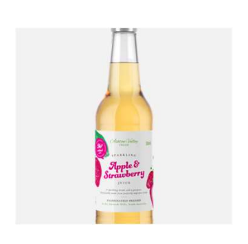
BOTTLE $7 Ashton Valley sparkling apple and strawberry