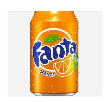
CAN Fanta 375mL