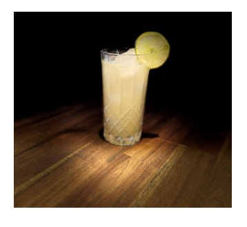
NO KICK MULE $1. Ginger Beer stirred with lime, soda water and a touch of sweetness. Garnished with a lime wheel.