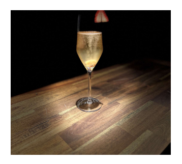
SWEET PROSECCO $14 Prosecco with a sweet sugar cube doused in bitters. Garnished with a strawberry slice.