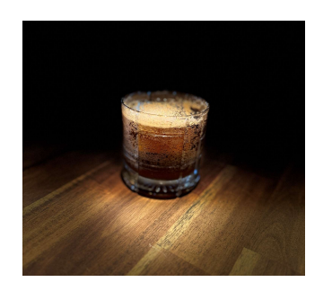
SHAPE SHIFTER $1: A blend of cola, lemon, maple syrup and soy sauce. Garnished with grated nutmeg