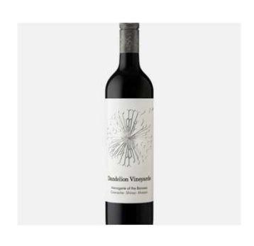
BOTTLE Dandelion Menageries of the Barossa G.S.M.