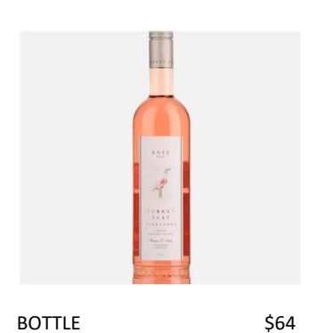
BOTTLE Turkey Flat Rose Barossa Velley