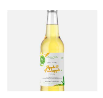
BOTTLE $7 Ashton Valley sparkling apple and pineapple