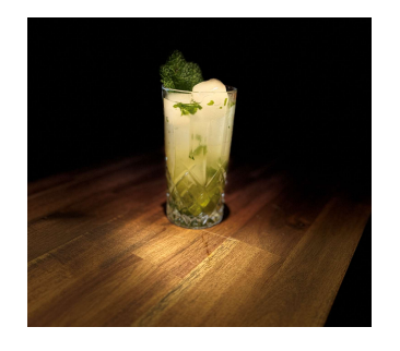
MOJITO $20 Rum muddled with mint and lime. Topped up with soda water. Garnished with mint leaves.