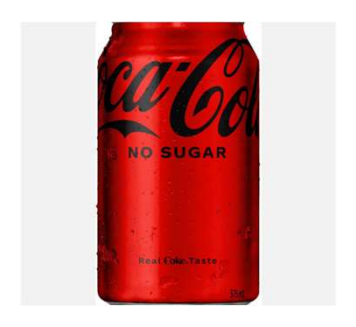
CAN Coke No Sugar 375mL