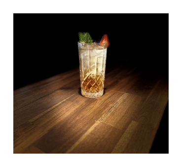
STRAWBERRY FIZZ $1 Strawberry and soda stirred with a hint of lime juice. Garnished with mint springs and Bitter doused in angostura bitters for aroma