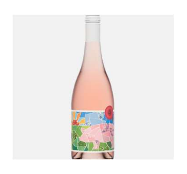
GLASS $10 BOTTLE $48 Lienert Tierra Del Puerco Rose