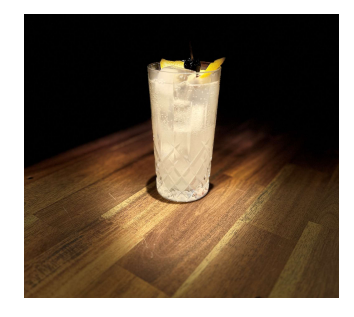
COLLINS $20 Gin based with freshly squeezed lemon juice and soda water. Garnished with a lemon twist and Maraschino Cherry.