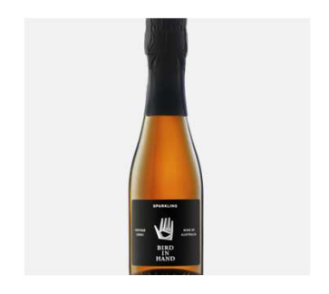
BOTTLE Bird In Hand Sparkling Piccolo