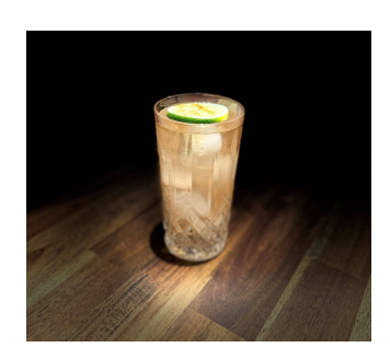
G & T $18 Gin with a hint of orange and topped up with tonic water. Garnished with a lime wheel.