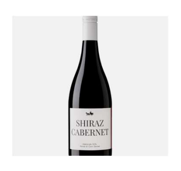
GLASS $9 BOTTLE $45 Horse and Cart Shiraz Cabernet